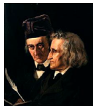
Wilhelm Grimm (left) and Jacob Grimm (right), portrayed by Elisabeth Jerichau-Baumann (1855)

I CLEARLY REMEMBER MY FIRST READING OF THE “TALES OF THE BROTHERS GRIMM” WHILE A YOUNG ADULT, AS THE ASPECTS OF DISCIPLINE AND CRUELTY, LEFT OUT OF POPULAR MOVIES I SAW GROWING UP, SPRANG FROM THE PAGE LIKE VERBAL JACKALS. I WILL LEAVE IT YOU, THE READER, TO LOCATE THESE EARLY “MORALITY TALES” AND FORM YOUR OWN REACTION, AS I DARE NOT MENTION THOSE ASPECTS HERE. LOVERS OF MODERN HORROR STORIES MIGHT ACTUALLY BE DRAWN TO THE GENRE.