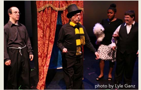
Silver Spring Inclusive Theatre Company A Premiered The Wizard of Ooohs and Aaahs in June 2013