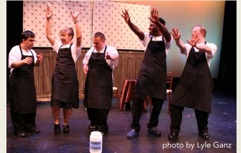
Silver Spring Inclusive Theatre Company B Premiered The Foncé Job in June 2013