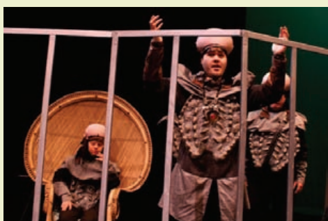
Arlington Inclusive Theatre Company A Premiered Oh My, An Invasion in March 2012