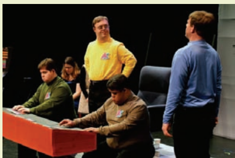
Arlington Inclusive Theatre Company B Premiered Star Corps IV: The Search for Mind-Zap in March 2012