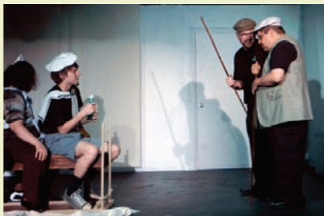
Raleigh Inclusive Theatre Company Premiered Timmy Twiddlemeyer and The Pumpkin of Destiny in February 2012

Original musicals created in partnership with the actors and directors