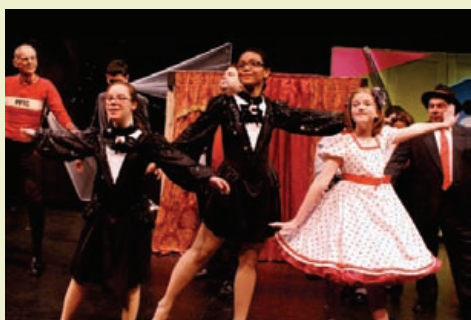
Silver Spring Inclusive Theatre Company A Premiered Back to the Past in April 2012